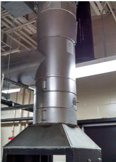
Laboratory fume hood applications shown with SELKIRK factory-built double wall and single wall venting.